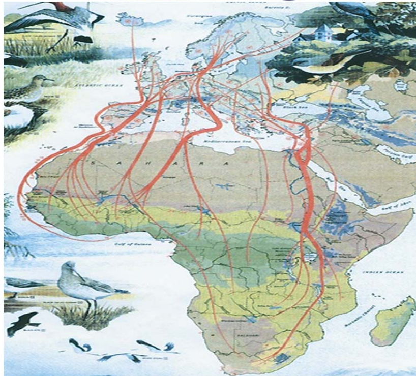
Figure 3 Wild bird migration into Africa