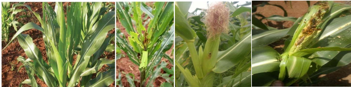
Figure 2 Damage by Fall Armyworm

It was also observed that although the pest has preference for maize, it can affect a wide range of plant species (over 80) some of which are the main cultivated staple food and cash crops such as sorghum, sugarcane, cotton, Irish potato, tomato, tobacco, spinach, crucifers, chrysanthemum, cucurbits, cucumber, sweet potato, common bean, cowpea, soyabean, groundnut, banana, and ginger. It can also devastate grass pastures thereby severely reducing the availability of livestock grazing pastures. FAW has the potential to remain active and to cause damage throughout the year and if not effectively managed has the potential to become endemic in the region. In maize the pest affects the crop at different stages from early vegetative stages up to physiological maturity. It damages leaves, feeds inside whorls on growing plants which destroys developing tassels and also feeds on developing kernels. All this means that the ongoing outbreaks will ultimately have huge impacts on crop yields in the region.