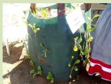
Photograph 2: Tower garden in the backyard of one of the participants in Makhuduthamaga Ward 31 in 2011

A tower garden concept was researched by Agricultural Research Council (ARC) in rural poverty stricken villages within Makhuduthamaga Municipal Ward 31 in Sekhukhune district of Limpopo province under the 2011/12 Eco-Technology program in collaboration with Limpopo Provincial Government Department of Agriculture (Photographs 2).