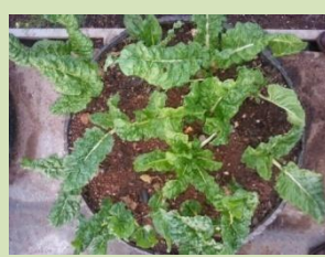
Photograph 1 : Spinach in a tyre