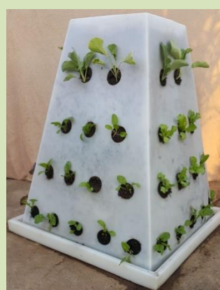
Photograph 7: Gardenizly®