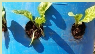
Photograph 6: Recycled Tank